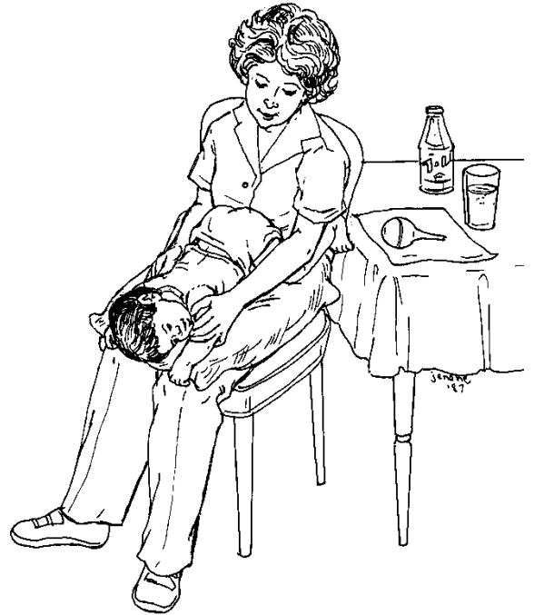
Picture 1 Holding the child in this position will help remove the mucus.